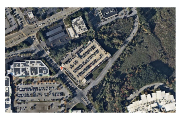
Logan Express –Framingham