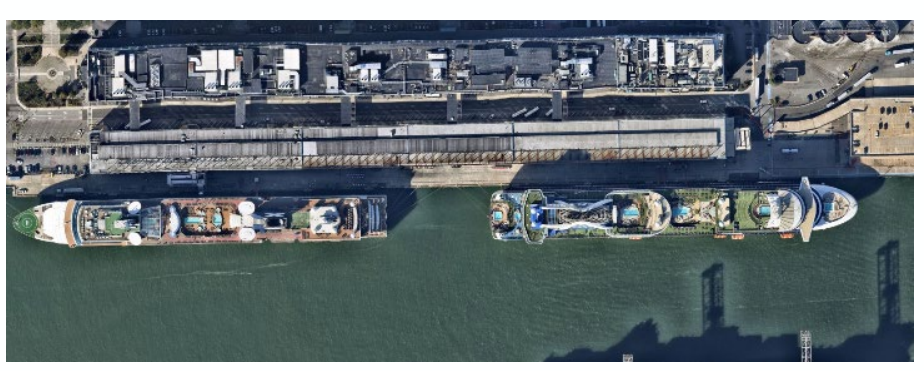
Black Falcon Cruise Terminal