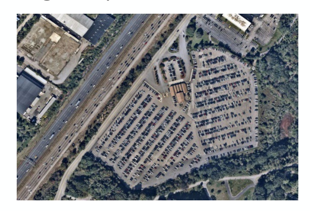
Logan Express –Braintree