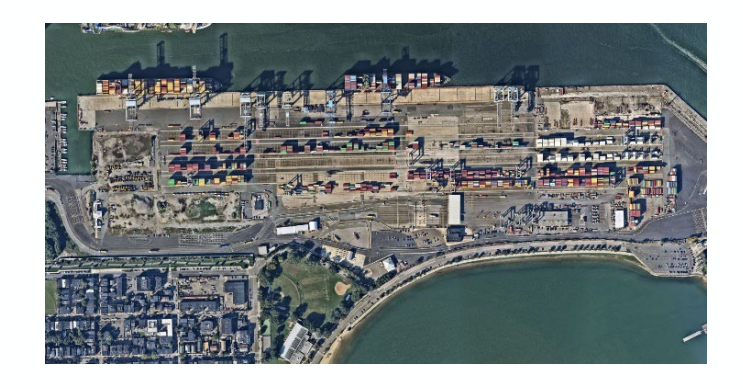
Conley Cargo Terminal