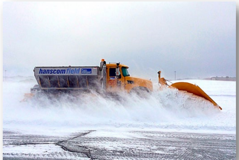
Hanscom Field Jet Operations

constructing a new 60,000-square-foot corporate aircraft hangar, while upgrading their existing terminal and hangar facilities. With higher activity levels and an increase in ground lease revenues, Hanscom Field has generated a positive net contribution over the last few years.